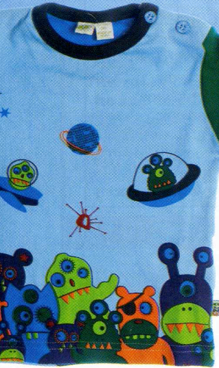
Me Too shirt